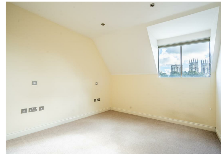
3RD FLOOR 732 sq.ft. (68.0 sq.m.) approx.